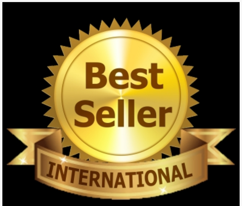
Best Seller Badge for Underdog: A Veterinarian's Fight Against Racism and Injustice