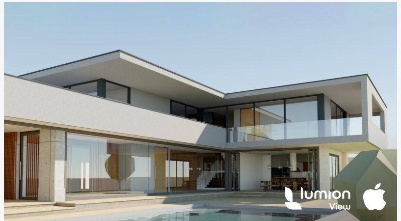
Real-time rendering inside SketchUp for Mac