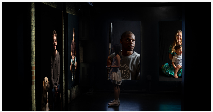
Floor to ceiling portraits display the faces of Usher syndrome