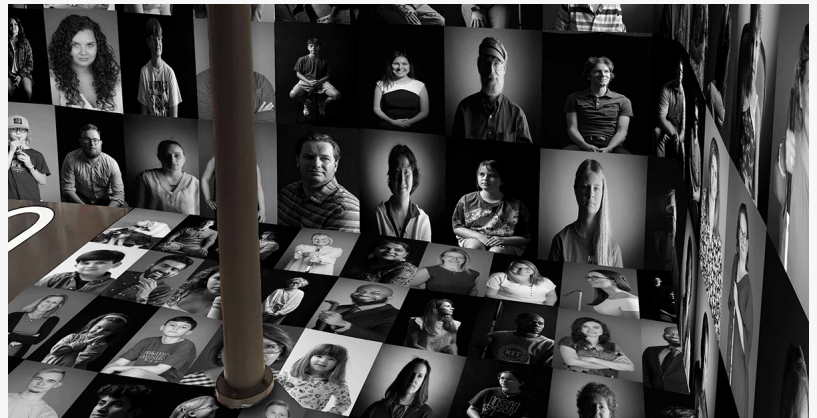
photographs taken over a decade of people living with Usher syndrome

From the moment you step inside, your senses are challenged. Darkness narrows your vision, and familiar sounds fade toward silence. Then, suddenly, you emerge into a breathtaking flood of sounds, stories, and color. Floor-to-ceiling portraits and sweeping films surround you, while microscopic images of the eye and ear glow like celestial constellations. Haunting in their beauty, powerful in their symbolism. You'll witness raw, intimate moments and hear voices of resilience that are typically reserved for private discussions.