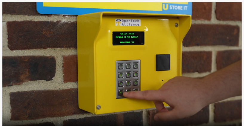
U Store It Manages Facility Access with INSOMNIAC CIA