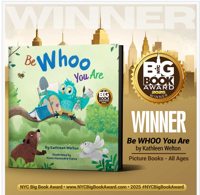
2025 NYC Big Book Award Winner

NYC Big Book Award received book submissions worldwide. Journalists, well established authors, small and large press, and first time indie authors participated in record numbers. Entries this year were received from the United States as well as countries such as Australia, Canada, China, Dubai, France, Germany, Italy, Portugal, Scotland, Singapore, Sweden, Switzerland, and the