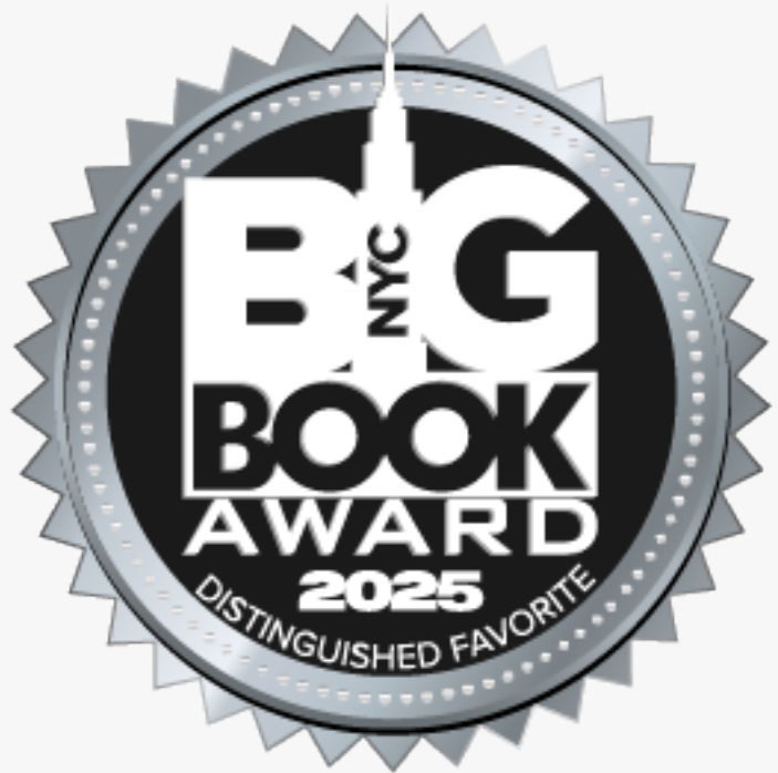
NYC Big Book Award Distinguished Favorite

Join us at the Awards Dinner on April 25th to celebrate the recipients of both programs as they