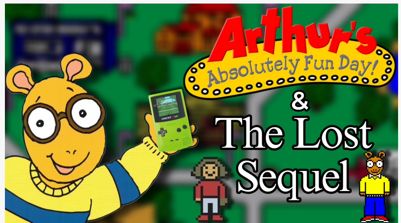
Arthur's Absolutely Fun Day! on Game Boy Color

Arthur's Absolutely Fun Day! was one of two console games based on author Marc Brown's Arthur IP published by The Learning Company at the tail end of their ownership under Mattel after a highly publicized acquisition. Arthur remains a top children's franchise today thanks to it's many books and worldwide distribution of its PBS animated series.