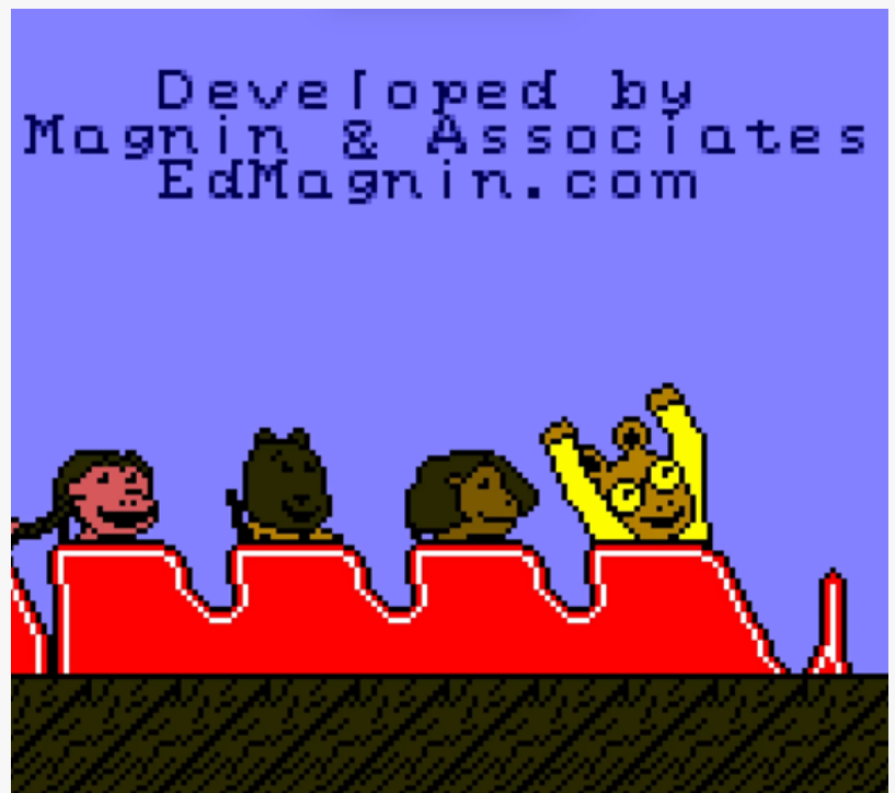
Arthur Game Credits