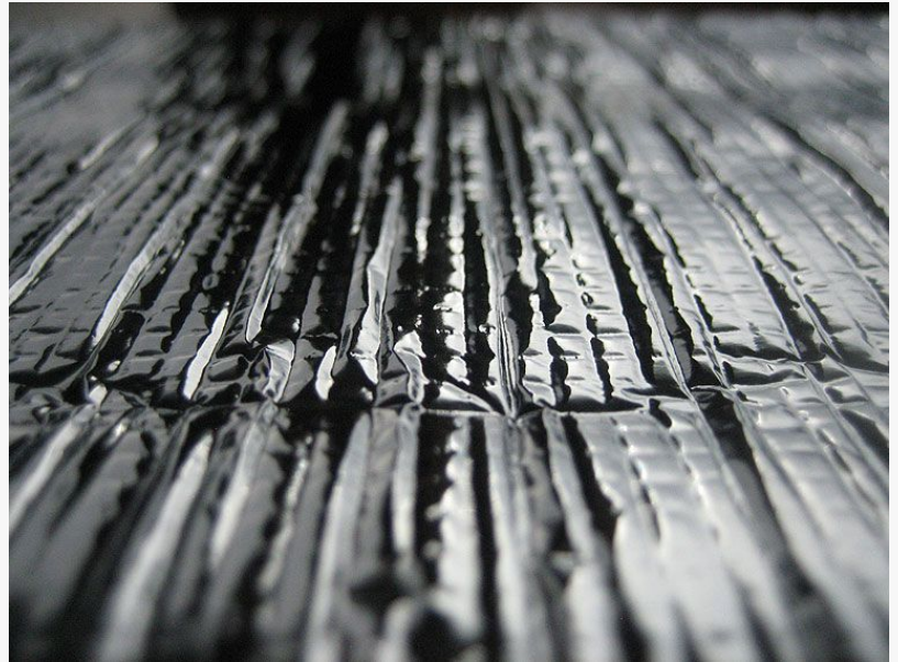
Foil on Prodex Total Insulation

For additional information on metal garage insulation and related installation guidance, visit: Metal Garage Insulation – Why Prodex Total Is the Best Choice.