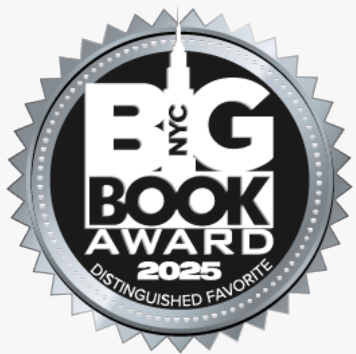
NYC Big Book Award Distinguished Favorite