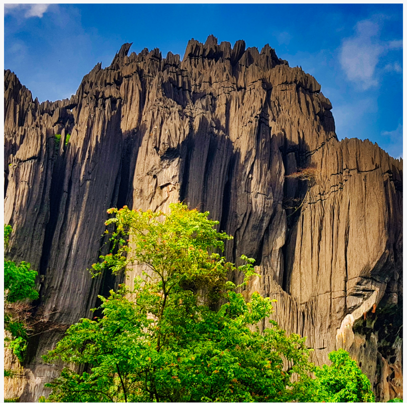
Yana Caves in the Heart of Karnataka

By participating in TTF Hyderabad 2025, Karnataka Tourism aims to enhance its engagement with travel agents, tour operators, and tourism industry professionals through B2B meetings, trade