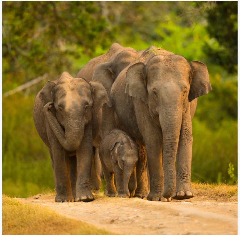
Elephant Family at Bandipur National Park in Karnataka

BENGALURU , KARNATAKA , INDIA, September 18, 2025 / EINPresswire.com/ -- Karnataka Tourism is set to participate in the upcoming Travel & Tourism Fair (TTF) Hyderabad 2025, scheduled to be held on 19 and 20 September 2025 at Hyderabad International Convention Centre (HICC). Recognized as one of India's leading travel trade exhibitions, TTF Hyderabad provides a dynamic platform for states and tourism stakeholders to present their offerings to both trade professionals and discerning travelers.