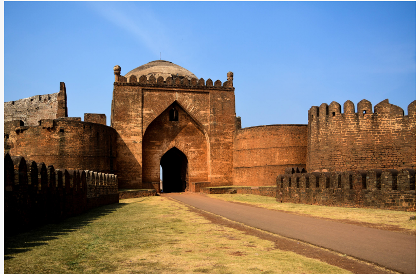
Bidar Fort: A majestic 15th-century fortress in Karnataka