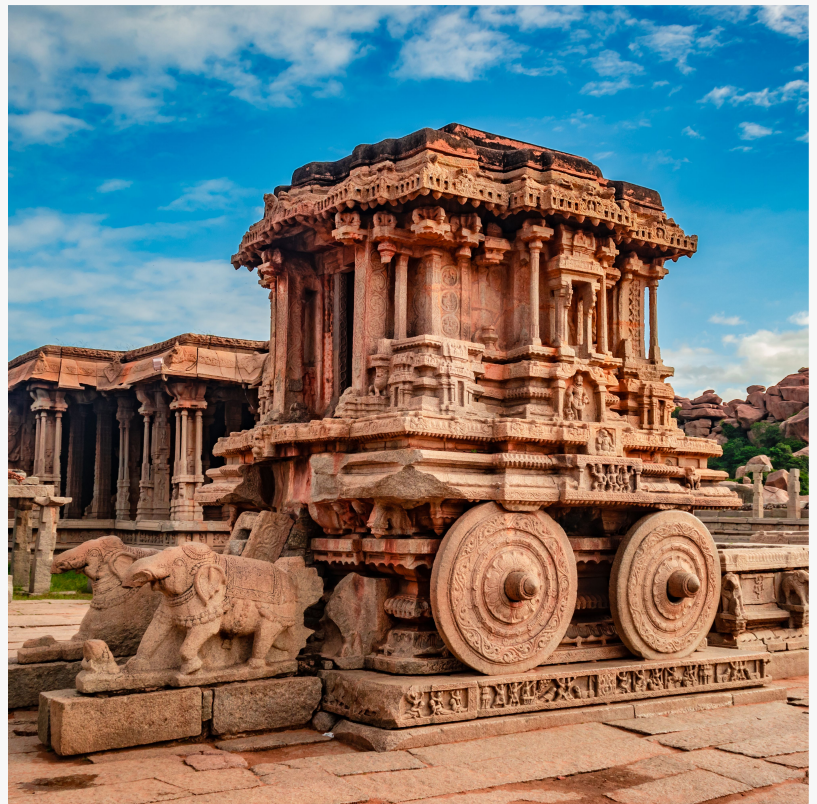
Stone Chariot of Hampi: An Icon of Timeless Craftsmanship and Architectural Brilliance