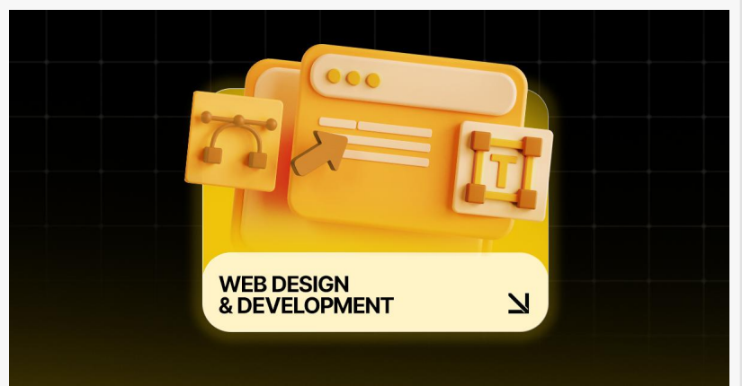
Top Web Design and Development Services In Singapore

We've already helped industry-leading companies in Singapore rise in both traditional search and