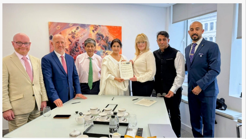
TUFF Earth Global Trustees with IMF Co-Founder

This press release can be viewed online at: https://www.einpresswire.com/article/850250204