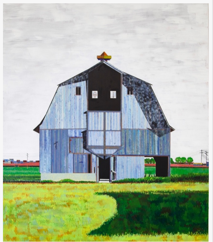
Barn #2, Don Hershman (2022), Acrylic, Ink, and Pencil on Wood Panel, 84" x 72"