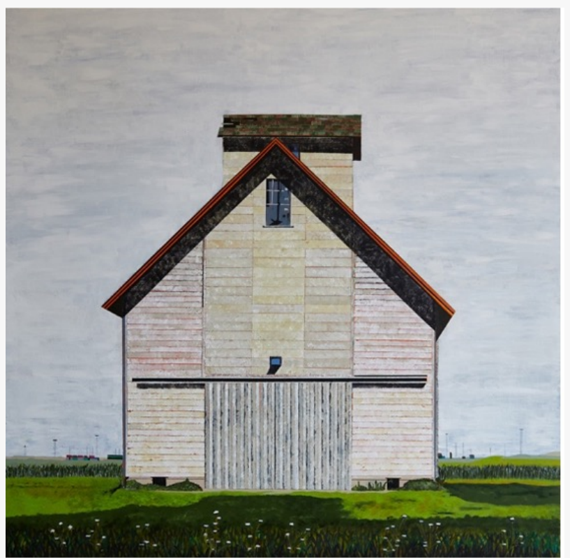
Barn #1, Don Hershman (2022), Acrylic, Ink, and Pencil on Wood Panel, 72" x 60"

Hershman's work has been collected nationally and internationally. His paintings have been jury-selected for the de Young Open (2020, 2023) and exhibited in solo shows, including Donald and Victor: Under the Influence (2021) and Code Switching (2023) at Salomon Arts Gallery in New York. His I AM A BARN series, exploring resilience through aging structures, was exhibited at Radian Gallery in San Francisco and featured on the cover of San Francisco Arts Monthly magazine (2024).