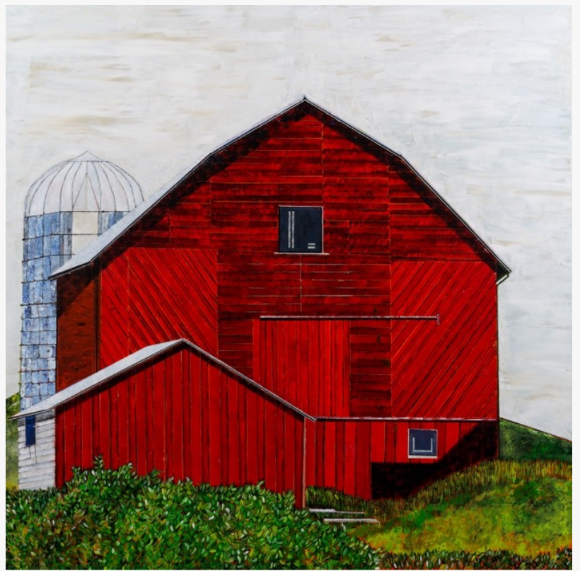
Barn #3, Don Hershman (2024), Acrylic, Ink, and Pencil on Wood Panel, 72" x 72"