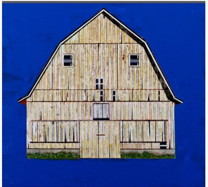
Barn #14, Don Hershman (2024), Acrylic, pencil, and ink on wood panel, 24" x 24"