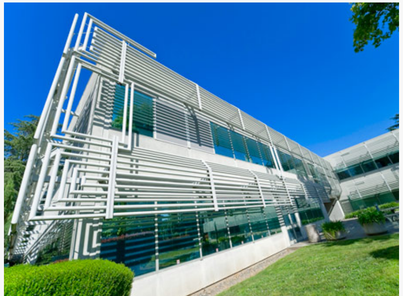
The Sacramento office of Karns & Karns Personal Injury and Accident Attorneys, a key regional hub in Northern California