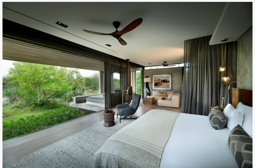
Cheetah Plains Karula Bedroom