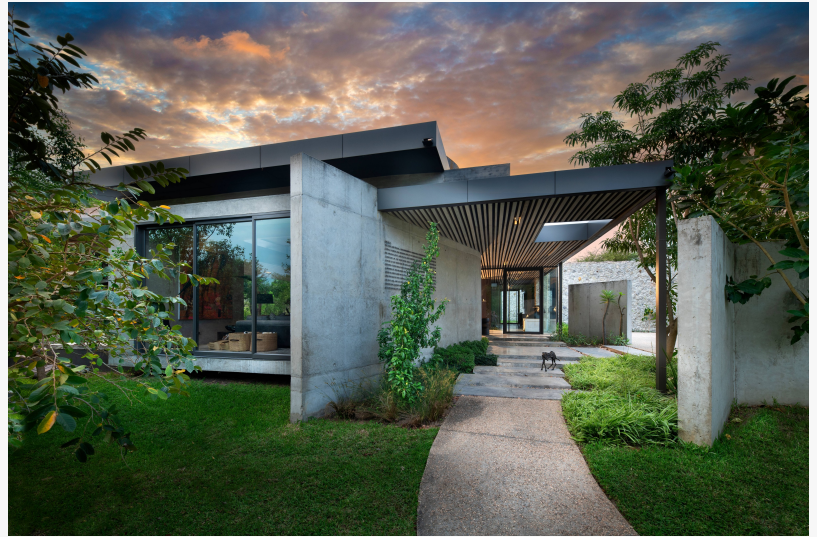
Cheetah Plains Mvula Entrance

This press release can be viewed online at: https://www.einpresswire.com/article/850425952