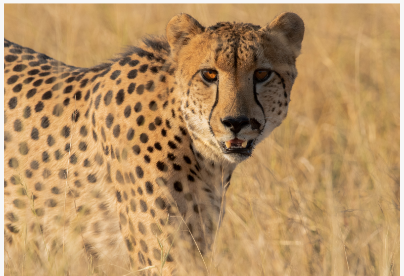
Cheetah Plains Cheetah