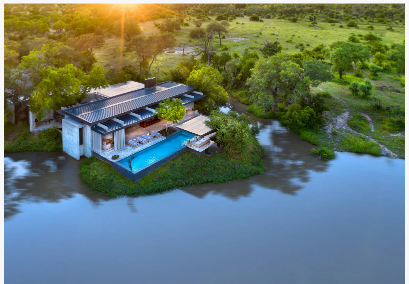
Cheetah Plains Main House