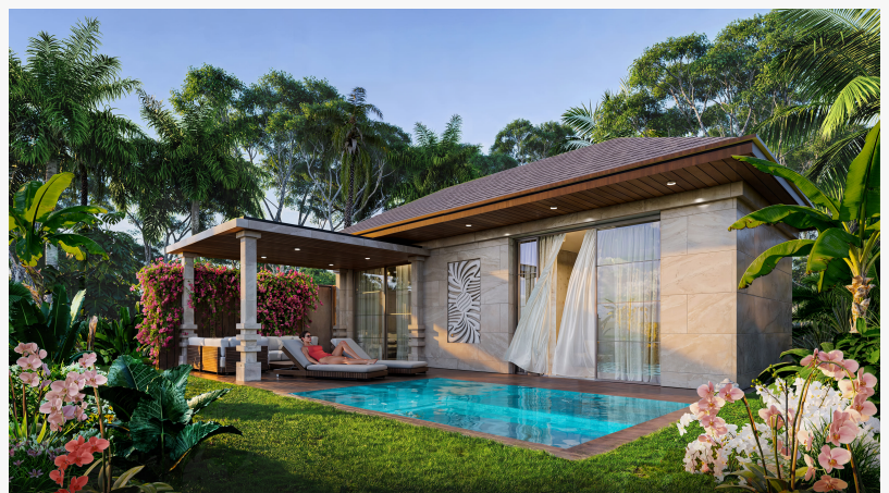
Visualization of the villas within the Ramada Nusa Dua by Wyndham project