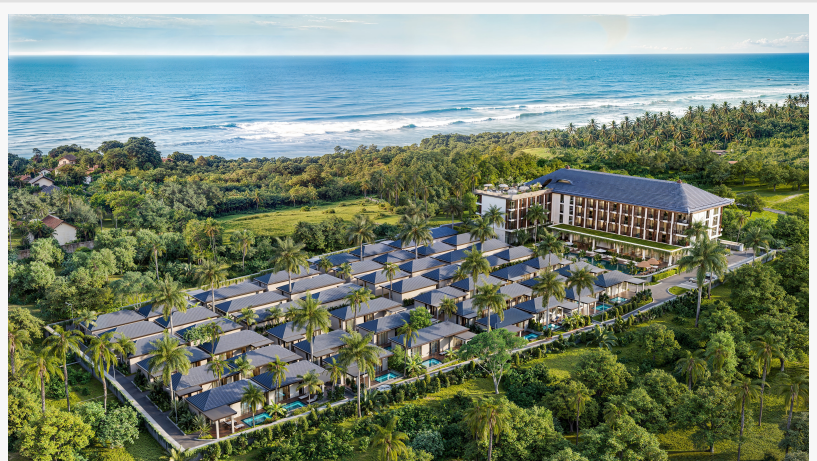
Visualization of the Ramada Nusa Dua by Wyndham project

The Art & Wellness concept combines artistic aesthetics, the finest examples of local art, an atmosphere of tranquility, and top-quality service. The project curator is MayinArt, a renowned Singapore-based gallery and one of the leaders of the Asian art market.