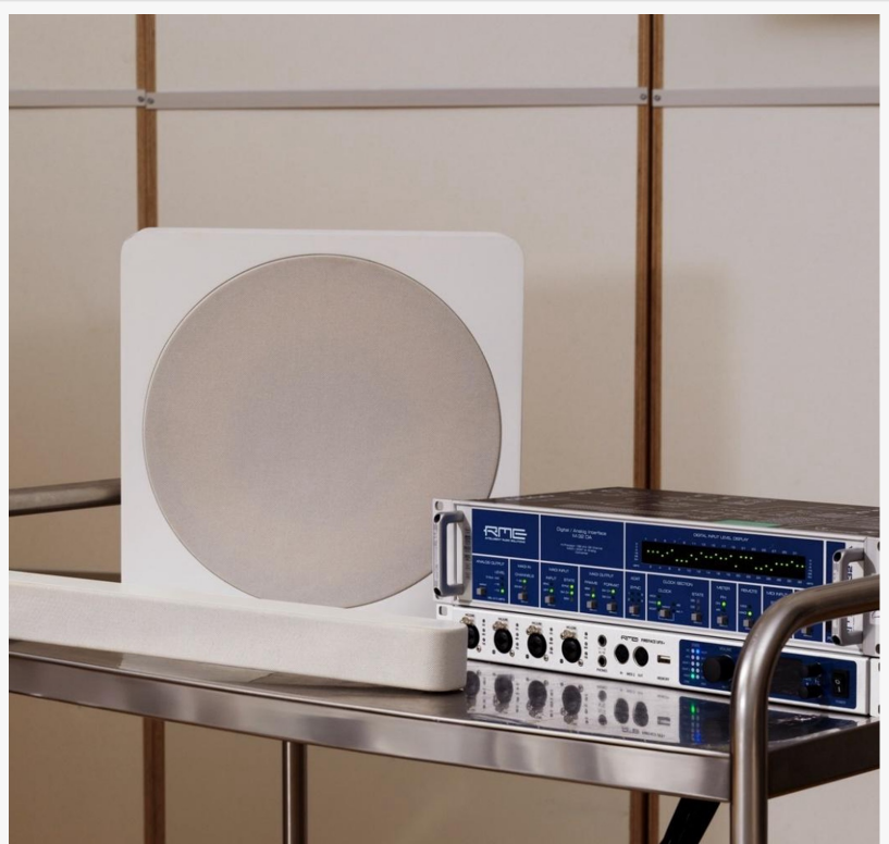
TCL and Bang & Olufsen Are Shaping the Future of Home Entertainment Through Sound and Vision

TCL South Africa The Platinum Club email us here