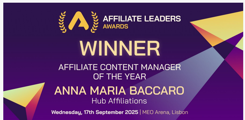
Premio Affiliate Leaders Awards