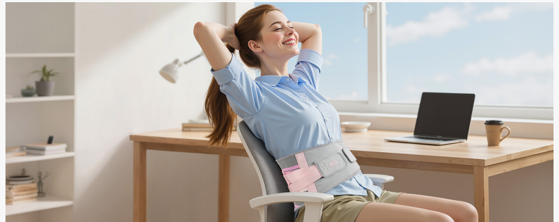
Rakiie women's waist support for daily comfort, maintaining your good condition