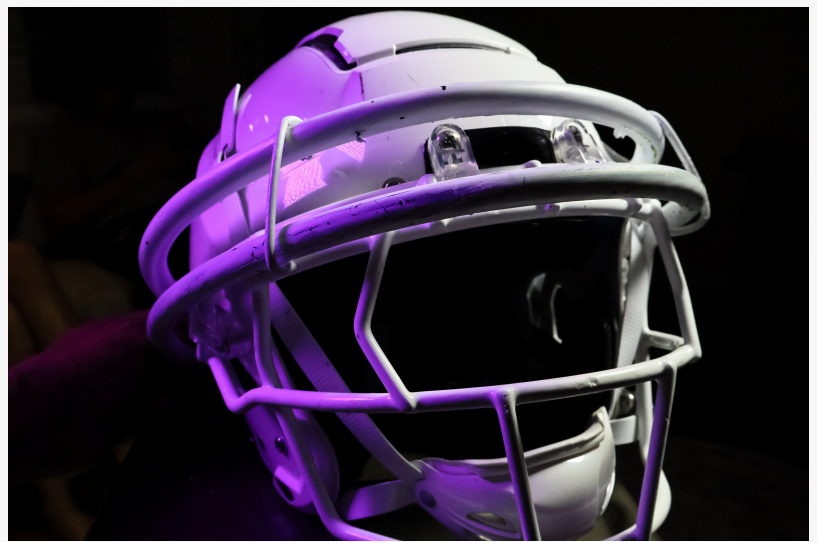
The Halo (Protective Helmet Mask) Patent Pending