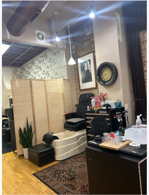
Colorist Board Certified

Our Team Caroline's Hair Design +1 708-453-1967 carolineshairdesign@gmail.com