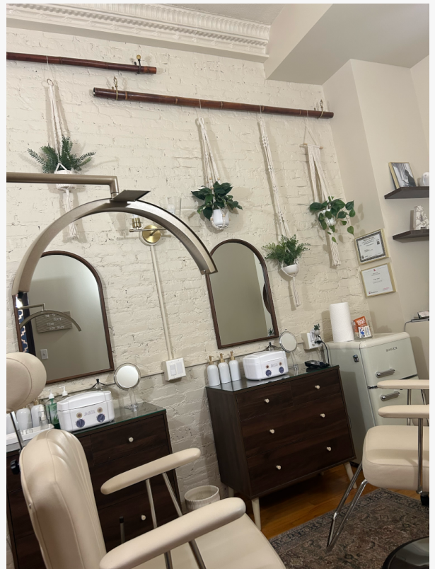
Open 7 Days a Week