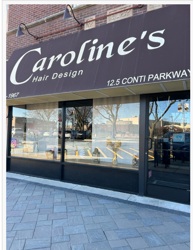
Caroline's Hair Design

When it came time to select this year's recipient, Caroline's Hair Design stood out as a reputable company in the hair and beauty industry. Known for its experienced, detailed, and friendly team, Caroline's Hair Design has earned a strong reputation within the Elmwood Park community, with