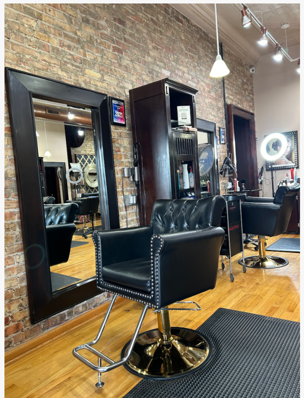
Award Winning Hair Salon