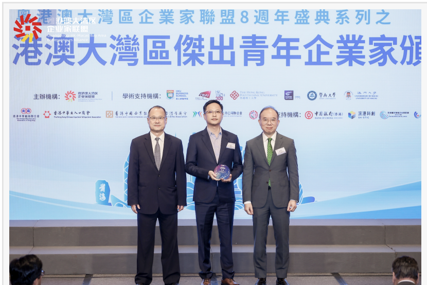
AndaSeat GBA Award