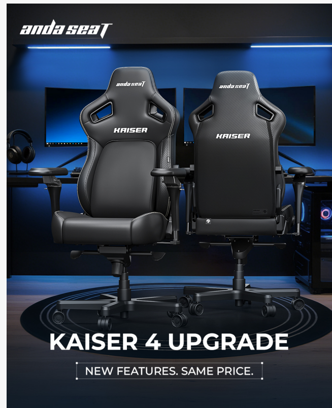
Kaiser 4 Series Upgrade

Today, AndaSeat exports products to over 30 countries and regions worldwide. It has established distribution and marketing networks in major gaming and lifestyle markets, supported by partnerships with more than 40 international esports teams and sponsorships of over 100 esports tournaments.