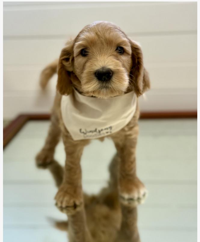
Goldendoodle ca -