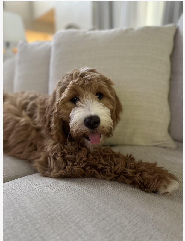
Goldendoodle breeder -

Tuxedo Goldendoodles refer to a coat pattern that features a dark base color, often black, paired with symmetrical white markings on the chest, face, or legs. The pattern resembles the look of a