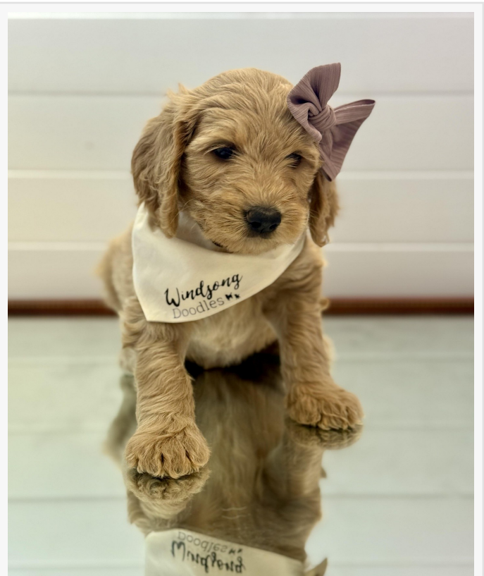
toy Goldendoodle -

Average lifespans for Goldendoodles range between 10 and 15 years. The information provided notes that diet, veterinary care, and exercise are key factors in maintaining health throughout a dog's life.