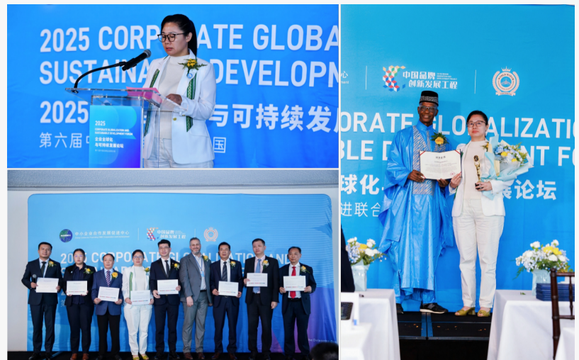
From Sanya's Haitang Bay to the Global Stage: Guohua Healthcare's Journey in Promoting Chinese Wellness