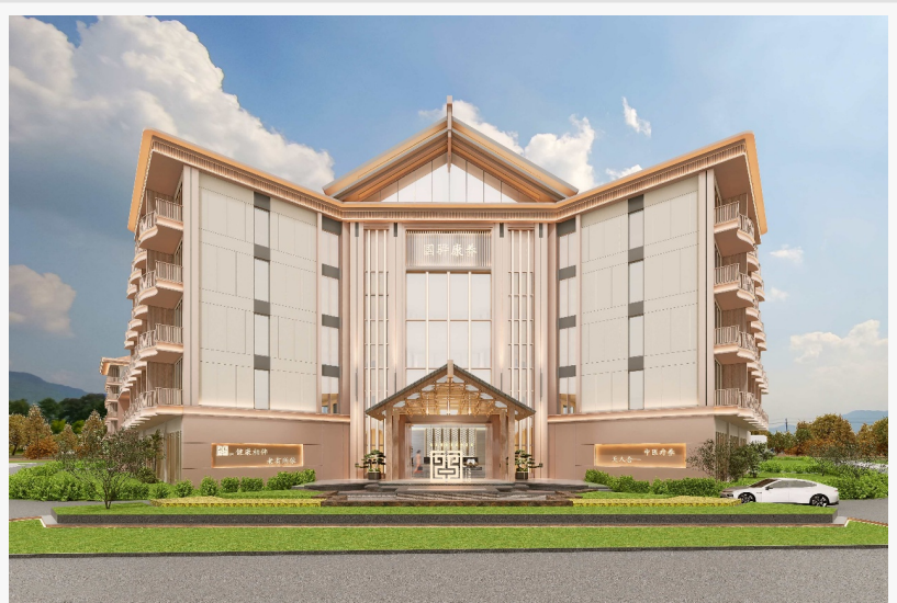
From Sanya's Haitang Bay to the Global Stage: Guohua Healthcare's Journey in Promoting Chinese Wellness