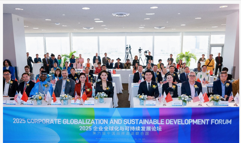
From Sanya's Haitang Bay to the Global Stage: Guohua Healthcare's Journey in Promoting Chinese Wellness