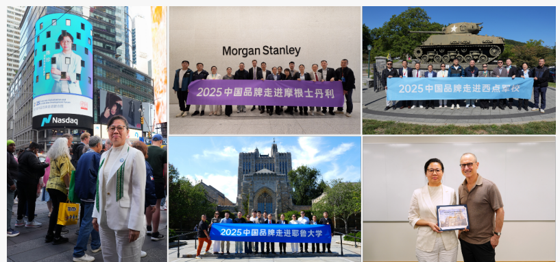
From Sanya's Haitang Bay to the Global Stage: Guohua Healthcare's Journey in Promoting Chinese Wellness