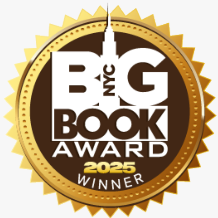
2025 NYC Big Book Award winner