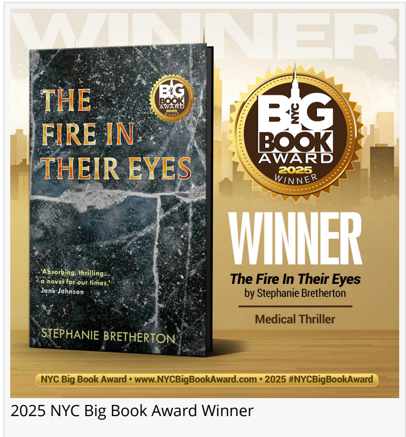
2025 NYC Big Book Award Winner

"An engrossing, urgent, polyphonic novel about the connections between the planet's deep past and our present unstable, unpredictable world, driven by a memorable cast of characters. A joy to read."