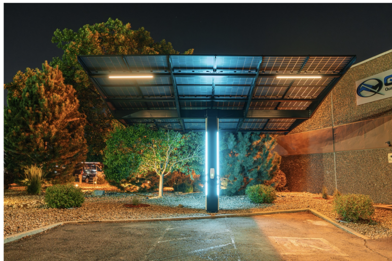
World4Solar Quality Audio Video Launch Event Pic1

Attendees—including QAV clients, local businesses such as Ferrari of Denver, homeowners, and press—experienced the full potential of the HelioWing 7 in action. The 9.84kWp system effortlessly powered a Ferrari, a TV, a DJ booth, and a wine fridge simultaneously – and is capable of powering an entire home. World4Solar executives showcased its advanced features, including a hybrid inverter for smart power distribution, RGBW LED lighting, and a 36kWh battery for nighttime or backup during grid outages.