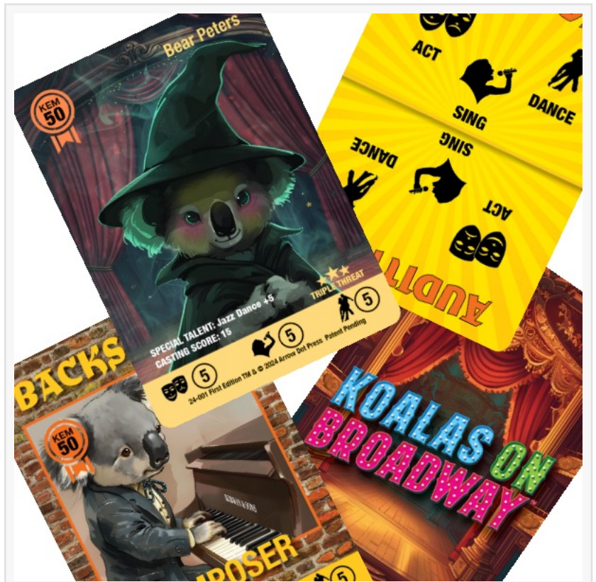
Koalas On Broadway Card Game - Cards

This press release can be viewed online at: https://www.einpresswire.com/article/852256129