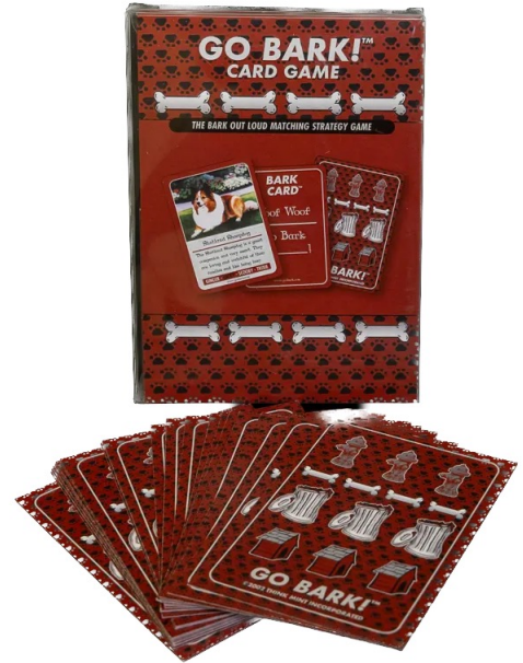
Go Bark Card Game