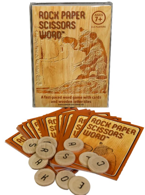
Rock Paper Scissors Word Card Game