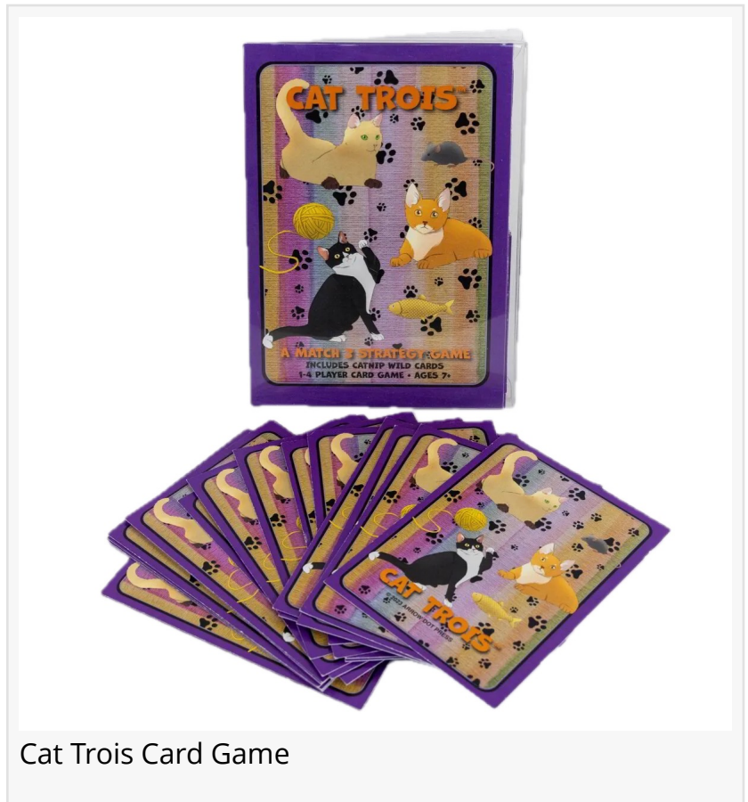
Cat Trois Card Game

Boxes: Instead of pricey custom boxes, Arrow Dot Press uses Calumet Carton's (Chicago) sturdy mailer - not a traditional game box, but very close, very high quality, and genuinely competitive with China. We wrap the box with laser printed belly band printed by SmartSet and it creates a sharp-looking deluxe two-player set of Koalas on Broadway™.