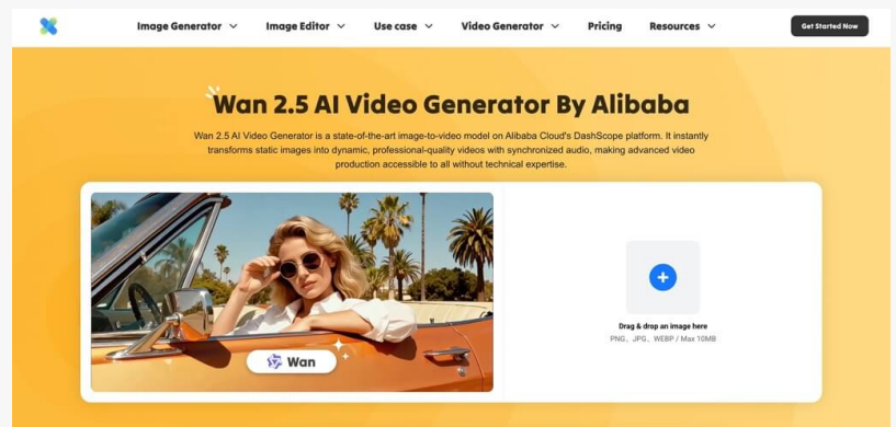
Wan 2.5 AI Video Generator