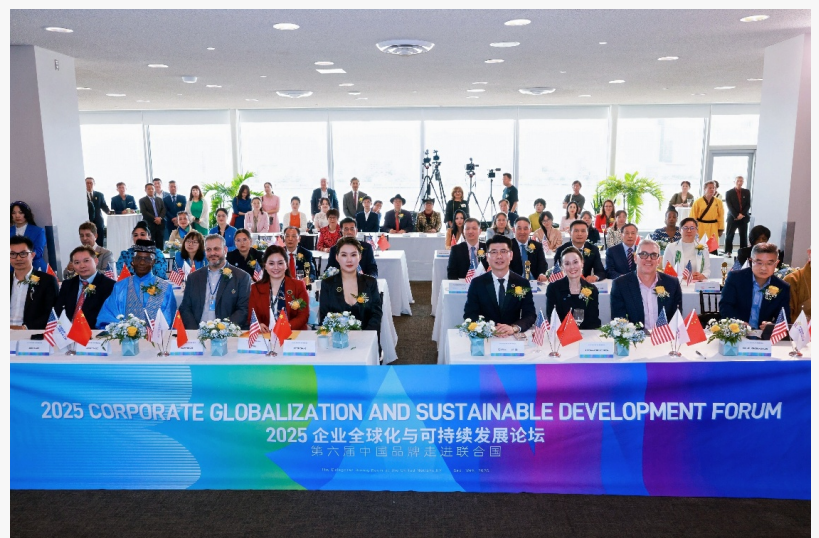
Timac agro Agriculture Shines at UN Forum, Showcasing Global Leadership in Sustainable Farming