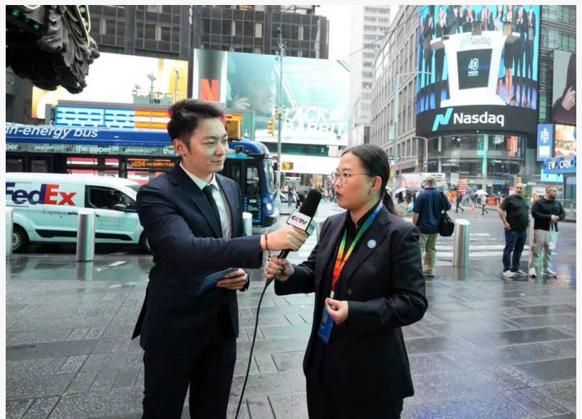
Timac agro Agriculture Shines at UN Forum, Showcasing Global Leadership in Sustainable Farming

At the UN forum, Timac agro Agriculture reaffirmed its alignment with the United Nations Sustainable Development Goals (SDGs) and EU food standards. The company has integrated green management practices across its supply chain, from adopting clean energy to reduce carbon emissions to developing closed-loop nutrient recycling systems. These initiatives help farmers increase productivity while minimizing environmental impact, striking a balance between economic growth, social responsibility, and ecological preservation.