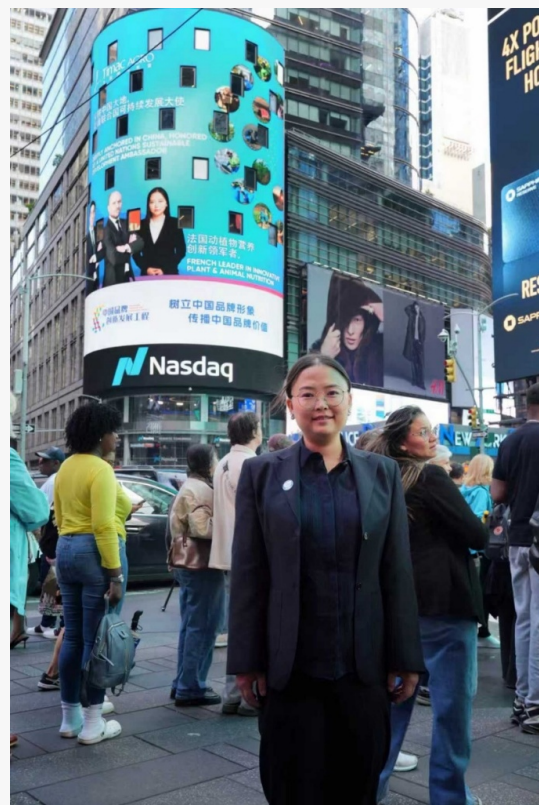
Timac agro Agriculture Shines at UN Forum, Showcasing Global Leadership in Sustainable Farming