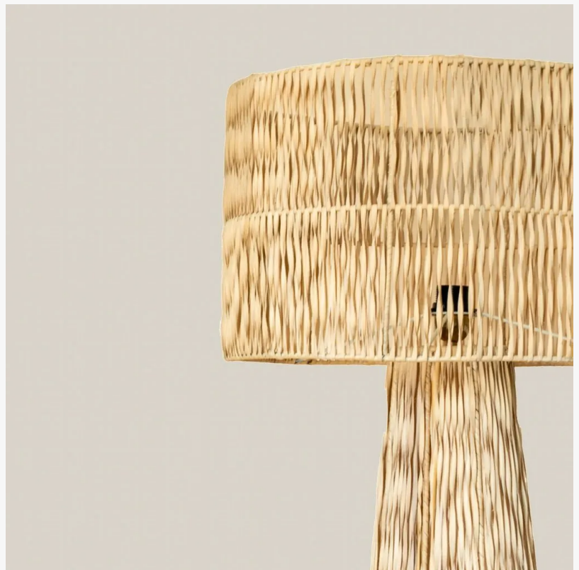
Beach club furniture setup with outdoor daybeds