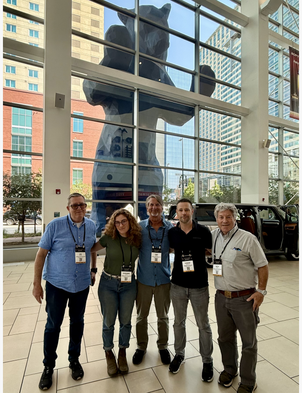
Cardinal sales and Shades by Matiss at CEDIA Expo in Denver, CO

With over 50 years of proven expertise, Cardinal Sales has established itself as a trusted partner in the consumer electronics industry. Serving Indiana, Ohio, Michigan, Kentucky, West Virginia, and Western Pennsylvania, the company represents top manufacturers with a reputation for excellence, strategy, and service.