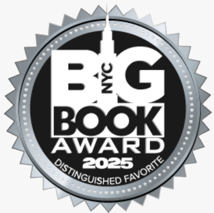
NYC Big Book Award Distinguished Favorite