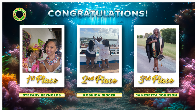
2025 Locs All Summer Winners