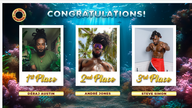
2025 Loc Bruh Summer Winners