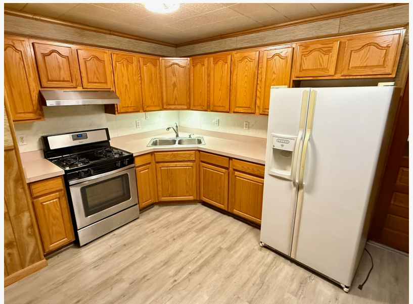
140 Capital Dr., Martinsburg, WV 25401