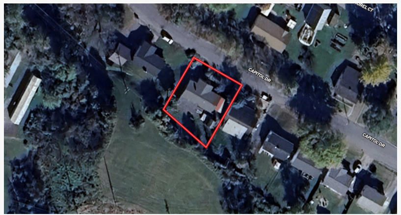
140 Capital Dr., Martinsburg, WV 25401

Nicholls Auction Marketing Group, Inc., with over 55 years of auction