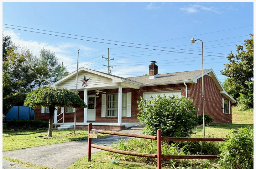
140 Capital Dr., Martinsburg, WV 25401