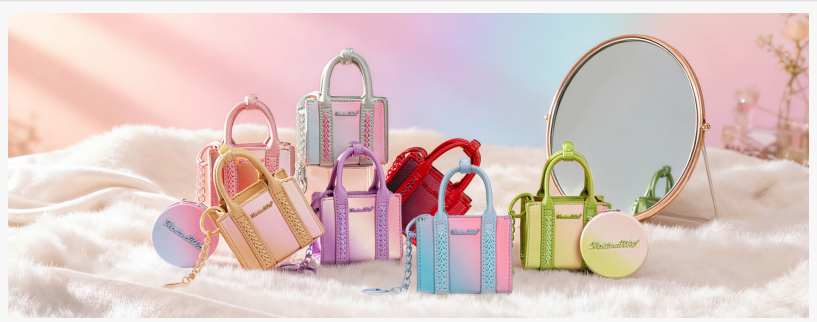
Montana West Mini Mood Tote Blind Box

Versatility defines their appeal: beyond adorning larger purses or stashing earpods, the totes double as stylish carriers for pet treats on leashes for cats and dogs. They enhance Labubu dolls as fashionable add-ons or, with added crossbody chains, convert into wearable minis for on-the-go flair. As holiday planning accelerates, these collections position Montana West at the intersection of tradition and trend, inviting collectors to unwrap joy—one mystery at a time.