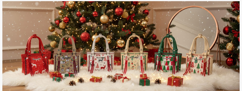
Montana West Xmas Mini Tote Blind Box