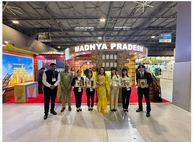
Madhya Pradesh tourism delegates with Japanese travel trade representatives

This press release can be viewed online at: https://www.einpresswire.com/article/852775081