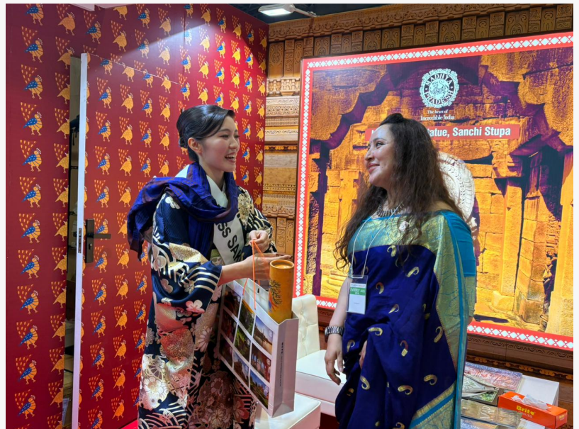
Interaction with the travel trade of Japan