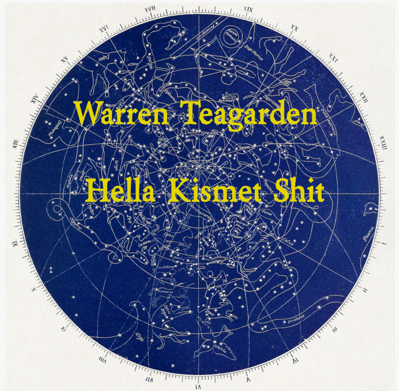
"Hella Kismet Shit" Cover Art by Warren Teagarden