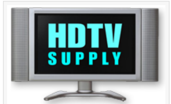
Atmosphere TV Now Available with WolfPack Matrix Switchers from HDTV Supply

LOS ANGELES, CA, UNITED STATES, October 1, 2025 /EINPresswire.com/ -- HDTV Supply, a trusted leader in advanced AV solutions, today announced the availability of Atmosphere TV, a unique streaming service that plugs directly into WolfPack Matrix Switchers. Designed exclusively for commercial use (no home use), Atmosphere TV brings businesses an engaging and brand-safe way to entertain and inform their customers.