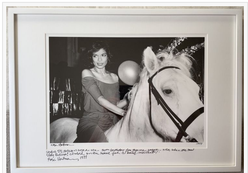
Bianca Jagger on a white horse at Studio 54 by Rose Hartman, presented by The Selects Gallery at the Minotti showroom in New York City

Minotti is a globally renowned Italian luxury furniture brand, recognized for its timeless design, exceptional craftsmanship, and sophistication. Since its founding in 1948, Minotti has been a