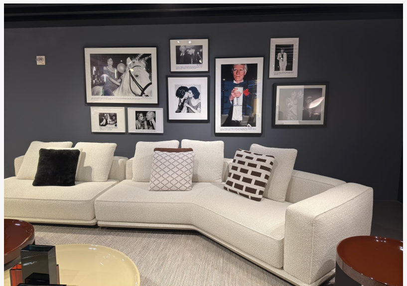
Gallery wall with iconic images of Rose Hartman of Studio 54 presented by The Selects Gallery at the Minotti showroom

NEW YORK, NY, UNITED STATES, September 26, 2025 / EINPresswire.com/ -- The Selects Gallery and Minotti are pleased to present "The Iconic 1970s: Portraits of Studio 54", at Minotti New York's showroom, an exceptional exhibition that delves into the unique energy of the 1970s through the lens of acclaimed photographer Rose Hartman.