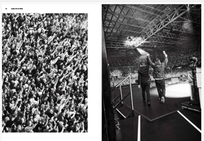
Oasis Live '25 - Spread From The Opus