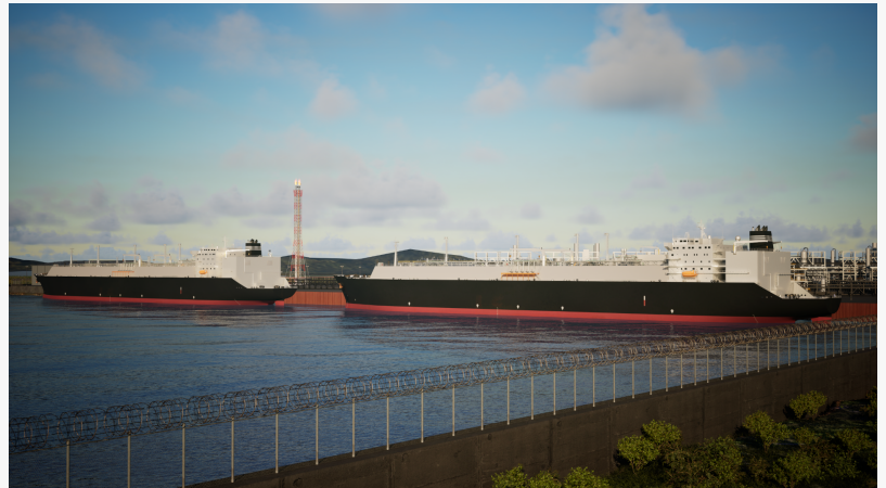
Argent LNG Ships