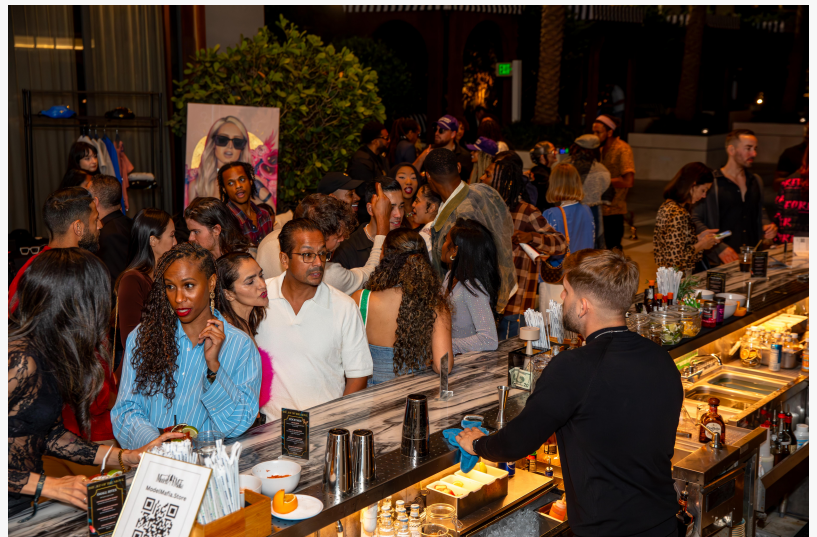
Art Basil 2024