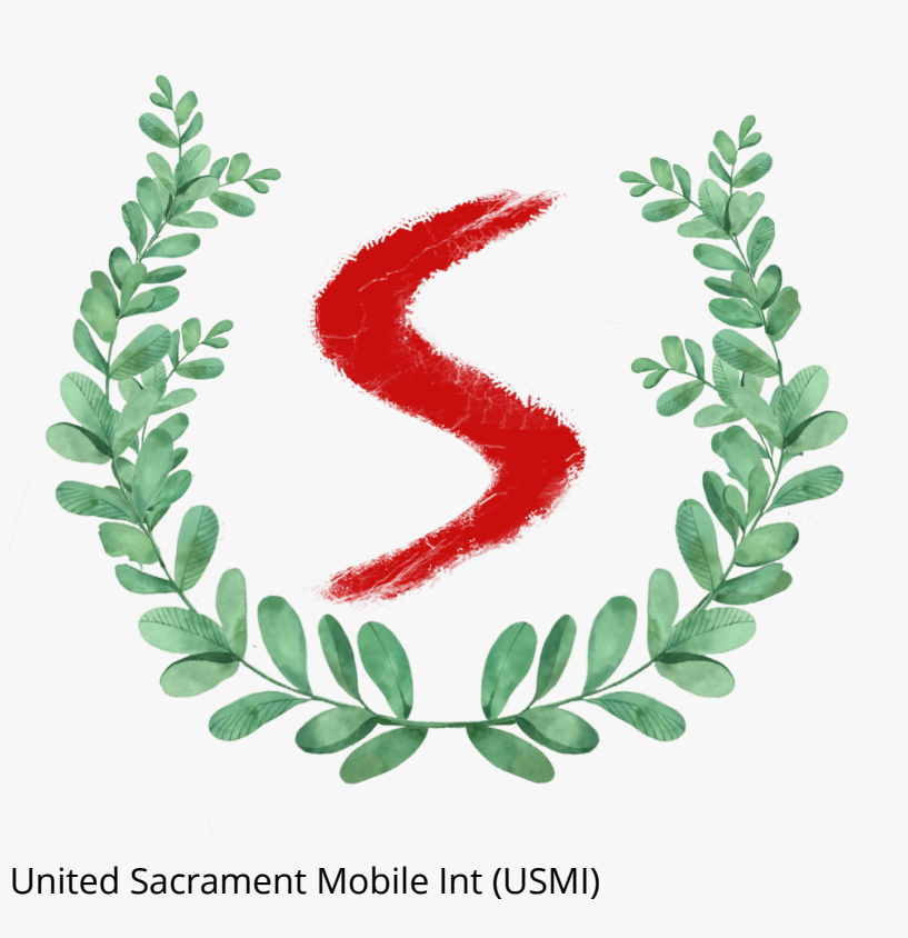
United Sacramento Mobile Int (USMI)