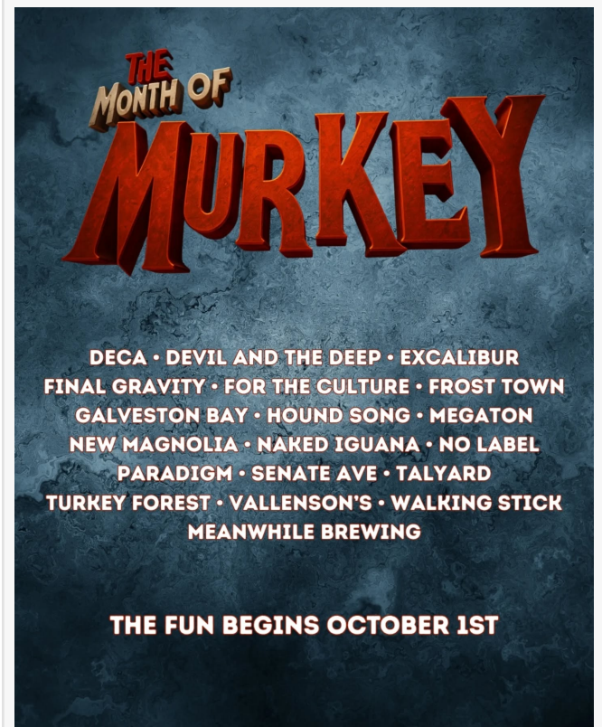
Month Of Murkey

More than just a tasting event, The Month of Murkey is an invitation to rediscover the city's dynamic brewing landscape. Spanning from Sugar Land to Pearland, Katy to Clear Lake Shores, and beyond, participants can embark on a self-guided or escorted journey through Houston's