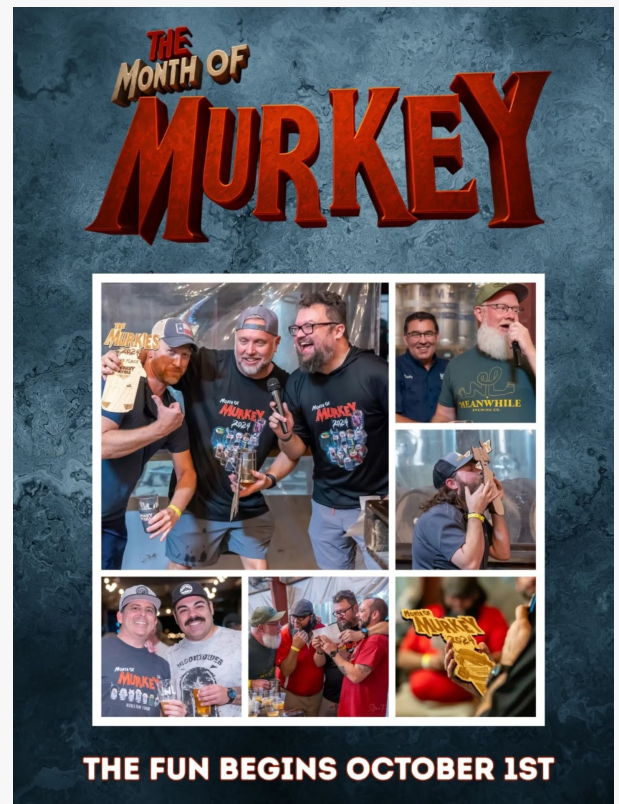
Month Of Murkey - The Murkies