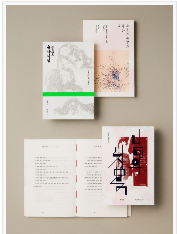
Photographs of the Special Hanji Edition Books

This project employed both traditional Hanji and printing-adapted Hanji, highlighting its strengths and versatility. Hanji, crafted from mulberry fibers using centuries-old techniques, is