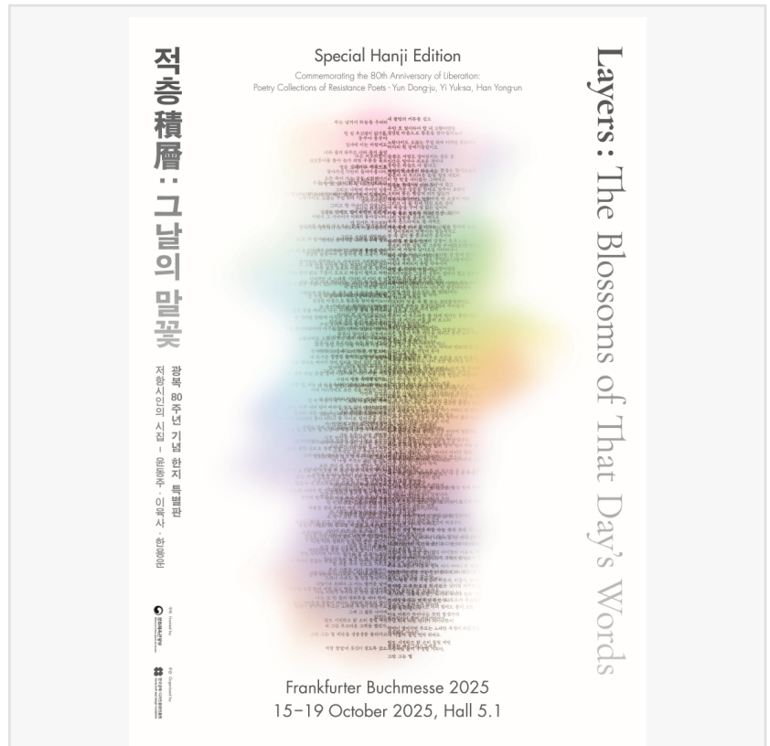
Exhibition Poster Layers: The Blossoms of That Day's Words