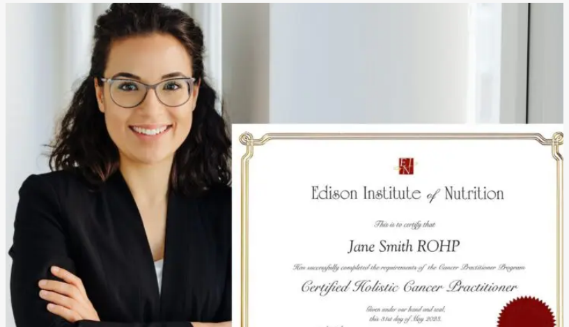
Nutrition diploma programs in Canada

The importance of evidence-based nutrition has gained increased recognition as Canadians seek to address health challenges related to lifestyle, diet, and chronic disease prevention. With more individuals looking for career opportunities in health and wellness, Canada nutrition schools are playing an important role in bridging the gap between academic knowledge and practical application.