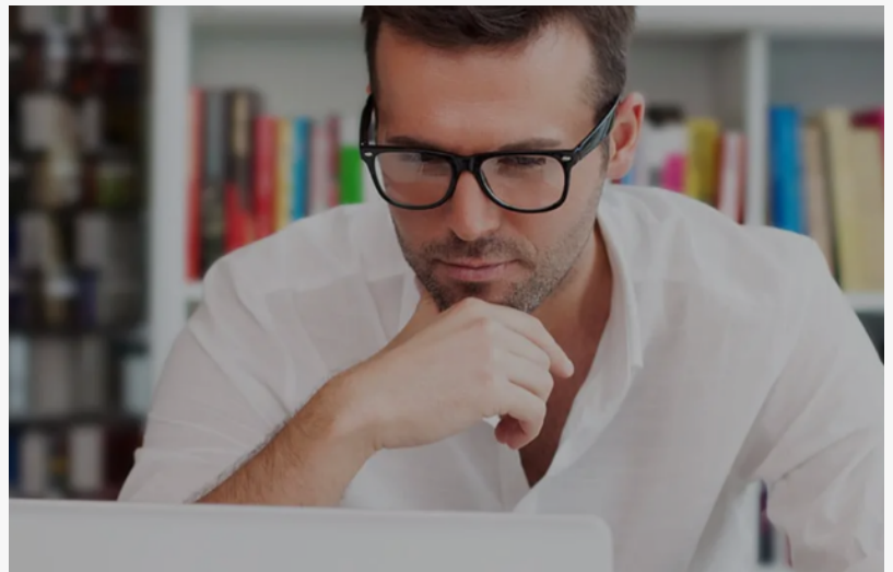
Edison Institute of Nutrition