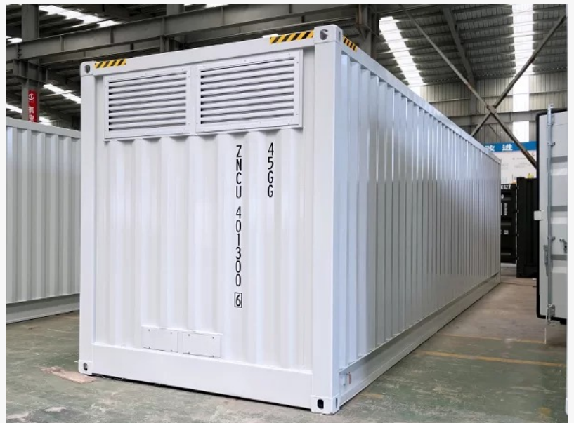
SolaraBox: Pioneering Mobile Solar Containers for a Sustainable Future