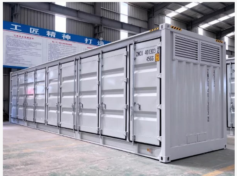
SolaraBox: Pioneering Mobile Solar Containers for a Sustainable Future

SolaraBox stands at the forefront of the clean energy movement, delivering mobile solar solutions that combine reliability, efficiency, and sustainability. Its speical systems are transforming how individuals, businesses, and communities access power, paving the way for a greener, more resilient future. To learn more about SolaraBox's cutting-edge products or explore partnership opportunities, visit the official website or contact the team at info@solarabox.com . Join the movement toward sustainable energy and discover how SolaraBox is powering a cleaner world, one mobile container at a time.