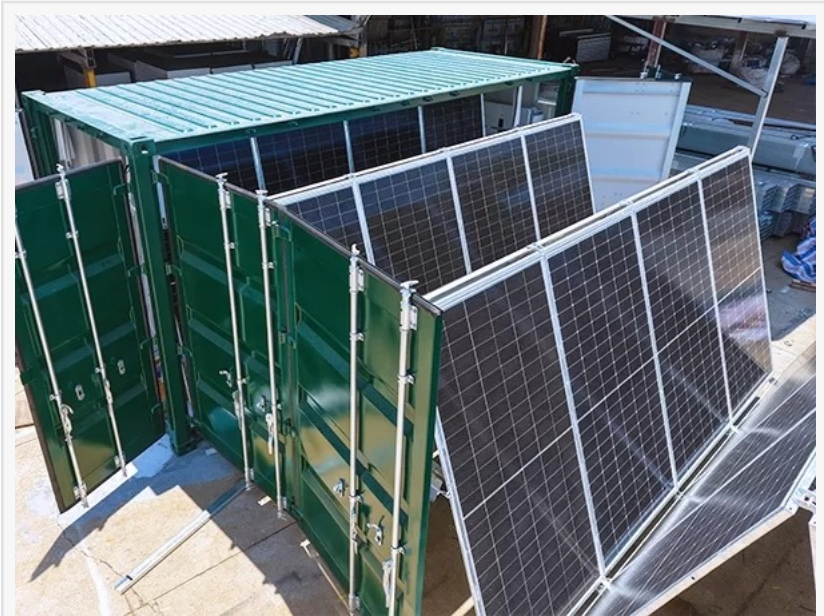
SolaraBox: Pioneering Mobile Solar Containers for a Sustainable Future

Additionally, SolaraBox offers comprehensive energy solutions that integrate solar, storage, and smart management technologies. These systems are engineered for durability, with weather-