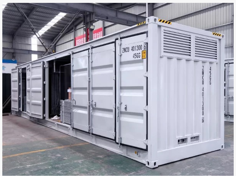
SolaraBox: Pioneering Mobile Solar Containers for a Sustainable Future

Founded with a vision to transform the renewable energy landscape, SolaraBox has grown into a leader in solar technology since its inception. The company has invested heavily in research and development, prioritizing rigorous testing to ensure its solutions are both practical and dependable. Having empowered thousands of users across diverse sectors, SolaraBox has built a reputation for delivering high-performance systems tailored to modern energy demands. This commitment to excellence has positioned the brand as a trusted