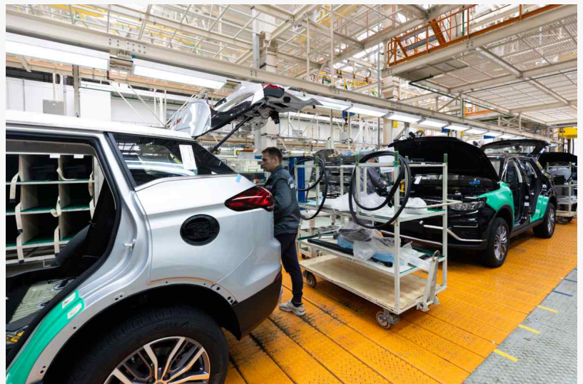
Automobile Industry in Transition