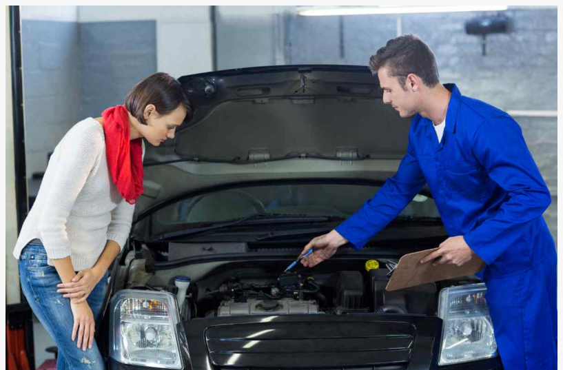
Expert Auto Repair Services.