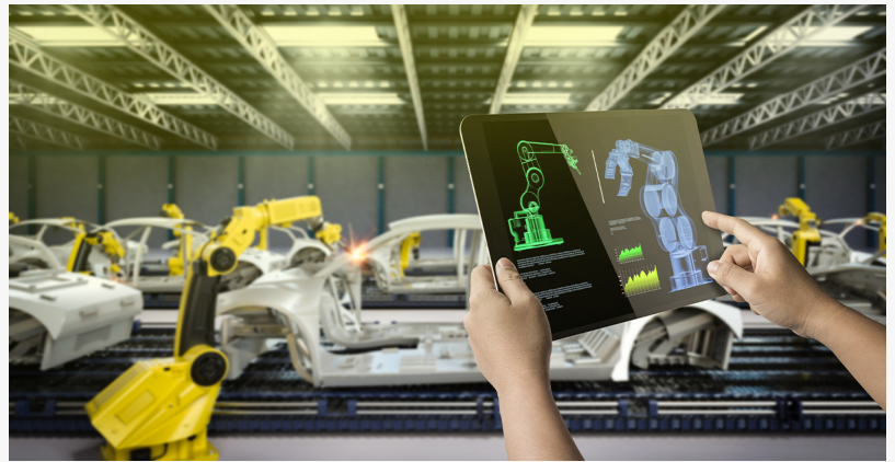
Global Automobile Industry in Transition A Tale of Diverging Markets

According to industry analysts, the global automotive market is not moving uniformly. Developed economies are seeing accelerated adoption of EVs and hybrid models, while many developing