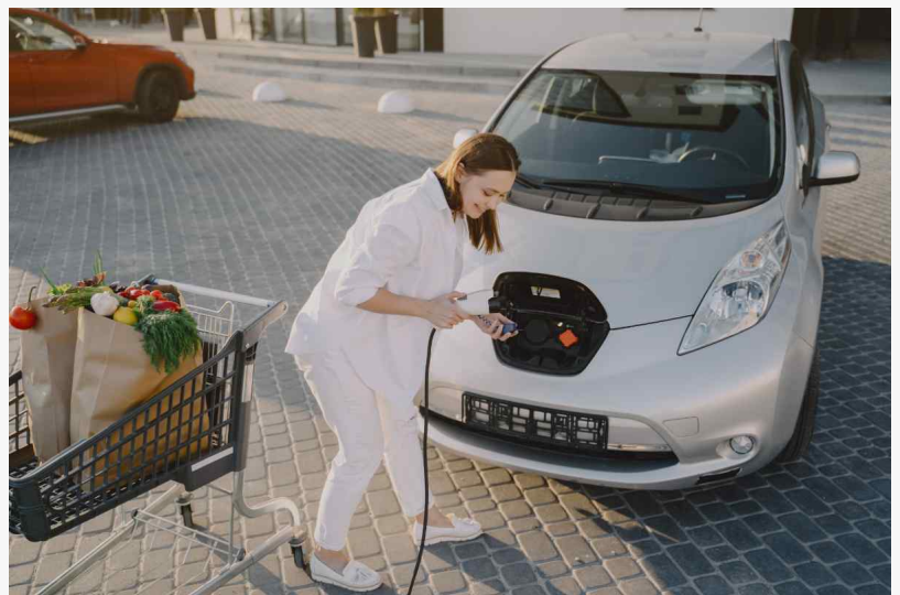
Electric Vehicle (EV) Sales