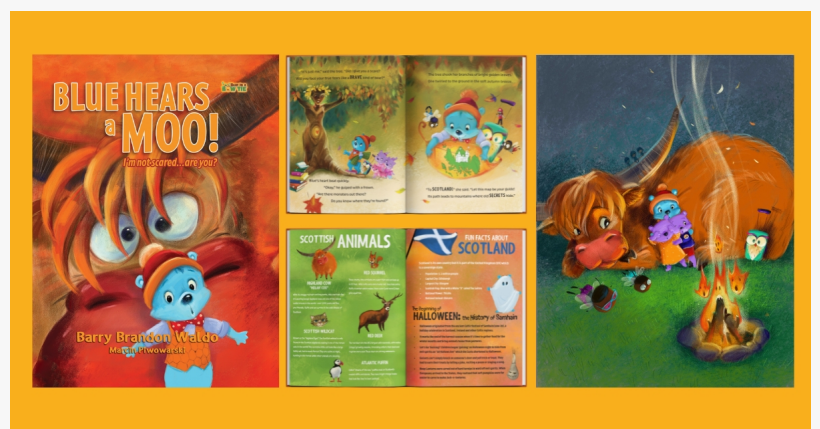
Blue Hears a Moo! Sneak Peak Inside the New Children's Picture Book