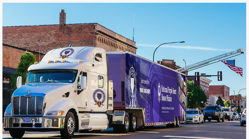
An exterior rendering of the National Purple Heart Traveling Tribute and Education Center arriving in a community as part of the Purple Hearts Across America Tour.

EINPresswire.com/ -- As "America 250" celebrations prepare to kick into high gear, the National Purple Heart Honor Mission is preparing to hit the road to bring a state-of-the-art mobile exhibition telling the stories of our nation's Purple Heart heroes to communities across America. The organization has announced that it is advancing the design of the National Purple Heart Traveling Tribute and Education Center, which is expected to launch early next year.