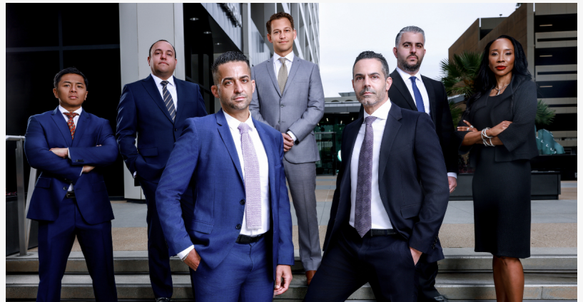
Team J&Y Law stands together in defense of a student injured at the Tracy Learning Center.